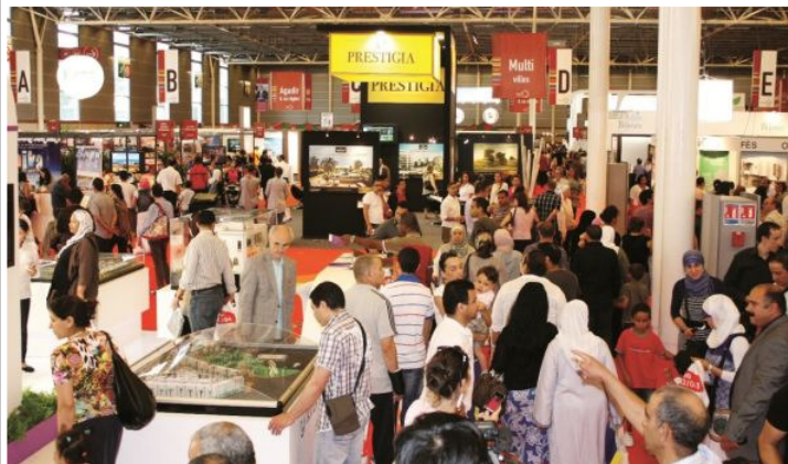
Captions: SMAP Expo Abu Dhabi takes place from 24-26 January at Abu Dhabi National Exhibition Centre.

Property investors based in the UAE who are looking to splurge on prime Moroccan real estate will be able to take advantage of a unique investment opportunity this week, when the capital hosts SMAP Expo Abu Dhabi for the first time.