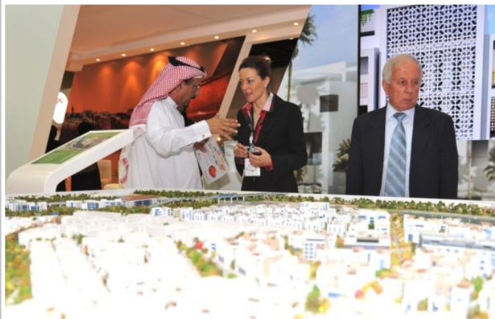
Caption: The first edition of SMAP Expo Abu Dhabi opened today at Abu Dhabi National Exhibition Centre, putting a spotlight on Moroccan real estate for the next three days.

Latest Moroccan property developments, dedicated conference, and famous performers share limelight at leading Moroccan real estate and lifestyle show