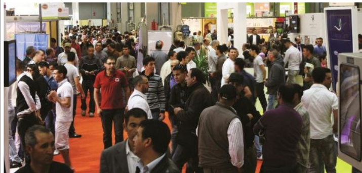
Caption: The first edition of the SMAP Expo Abu Dhabi opens its doors tomorrow at ADNEC, showcasing Moroccan real estate investment opportunities for thousands of UAE based investors.

Morocco's largest ever mixed-used development, a joint venture between Abu Dhabi based Al Maabar International and Morocco's Bouragreg Agency, will take centre stage tomorrow (Thursday) when the world's leading Moroccan real estate and lifestyle event opens its doors in the UAE capital.